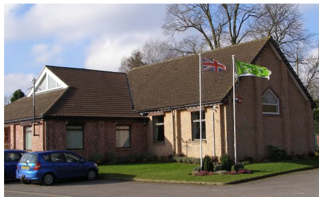
Botley Centre Hire Charges from 01 April 2013 (All fees are inclusive of VAT)