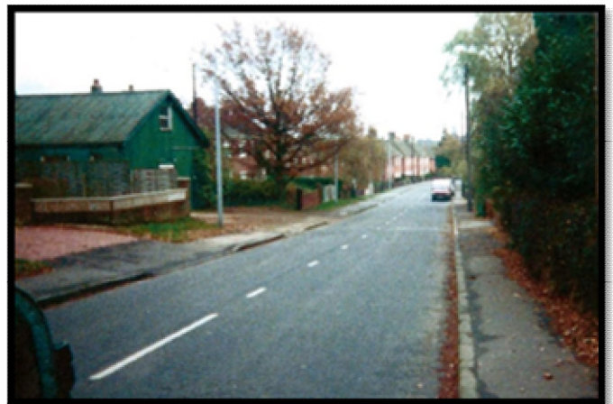
The British Legion Clubhouse, Winchester St—pre 1982

In 1979 it was realised that the building was decaying and rapidly becoming beyond repair. The committee decided that a new building had to be erected. However, there were many hurdles to overcome before planning approval was granted. To raise the money needed for the new building, a mortgage was required but it was found that the deeds were missing. In 1934 £500 had been borrowed from Brickwood's Brewery but when this sum was repaid in 1949 the deeds were not returned because they had been destroyed in an air raid on the Portsmouth Brewery. New deeds were prepared by a solicitor but delays were inevitable.