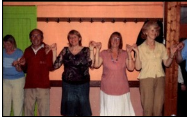
St Jean Brévelay 2009