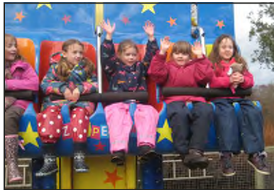
2 nd Broadoak Rainbows enjoying a ride on Jumping Jack.