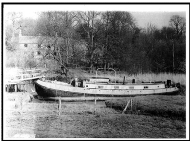
Hoe Moor Creek looking north with the abandoned Brickmaker's cottages (left background) c1910

Many villages had a brickmaking facility where if they were located on or adjacent to the raw material (clay). Botley is located over London Clay but only one brickworks is known to exist within the parish. This was at Hoe Moor Creek on its southern boundary.